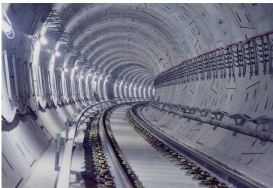
Changi Airport Line

We readily take on the big challenges, and pride ourselves on seeing them through. We hold ourselves accountable to our customers, partners, employees and other stakeholders by honoring our commitments, providing solutions, and striving for the highest quality output.