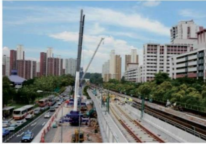
Jurong East Modification