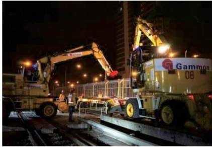
East West Line Sleeper Replacement