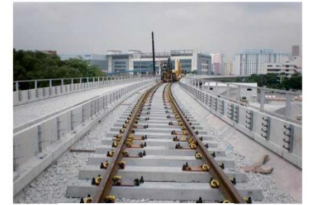
Boon Lay Extension