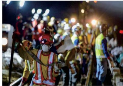
North South Line Sleeper Replacement